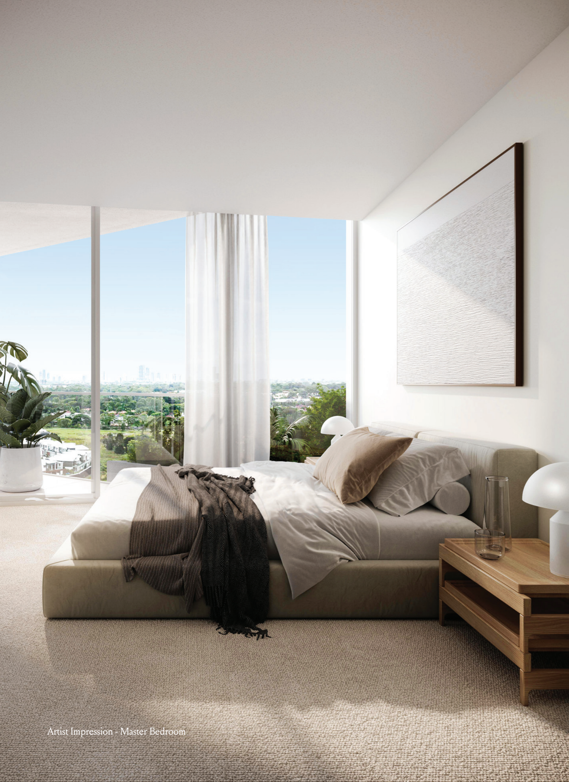
Artist Impression - Master Bedroom