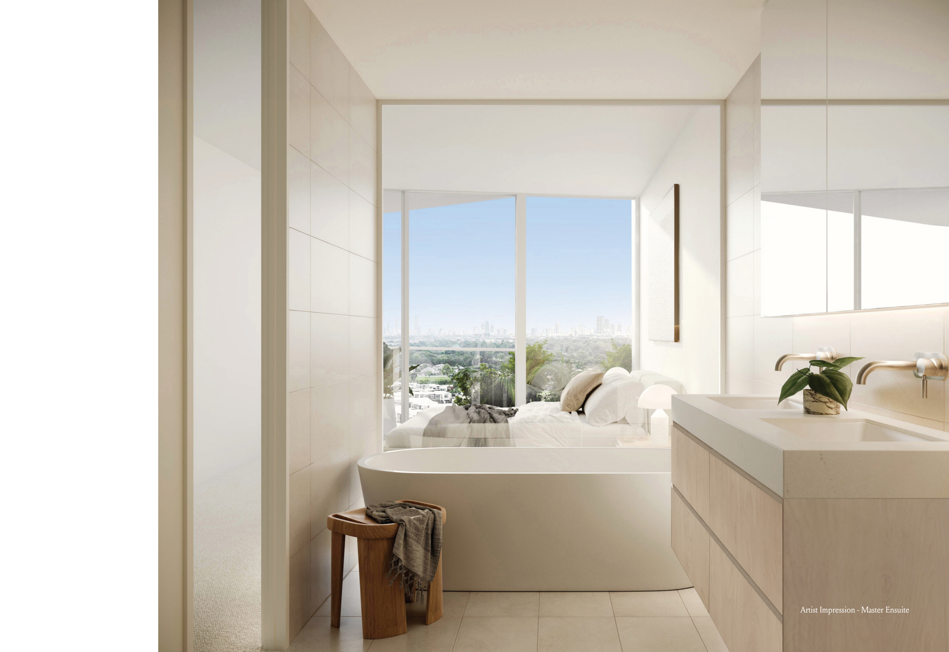
Artist Impression - Master Ensuite