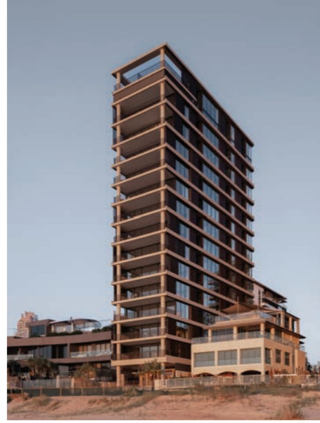
Dune Main Beach COMPLETE 2024