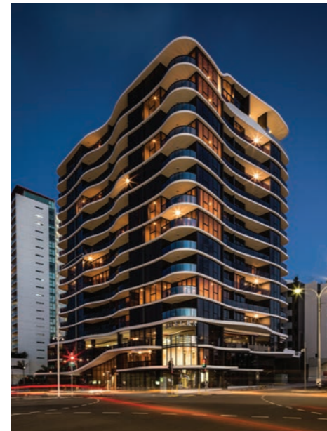
Allegra Southport COMPLETE 2017