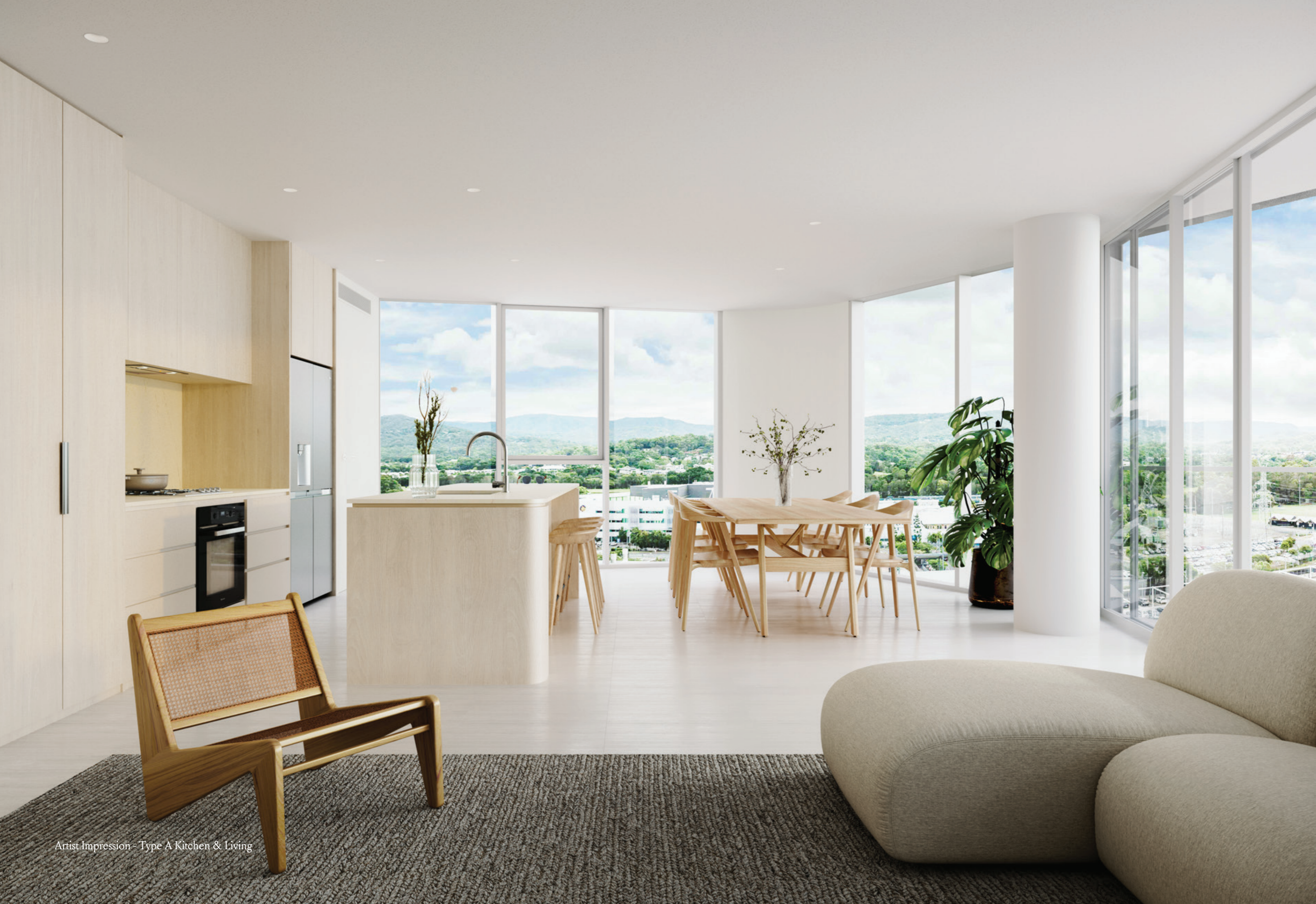
Artist Impression - Type A Kitchen & Living