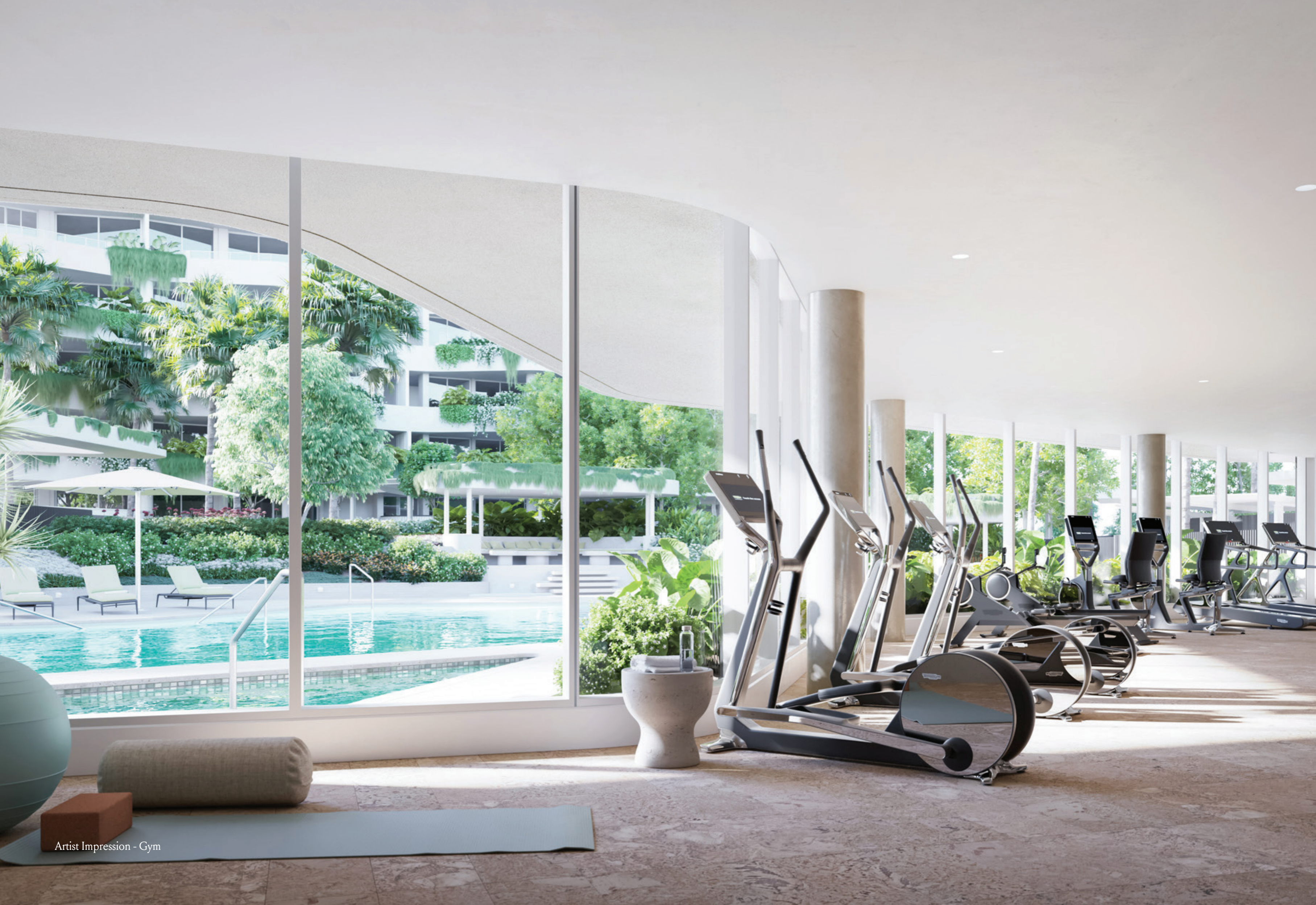
Artist Impression - Gym