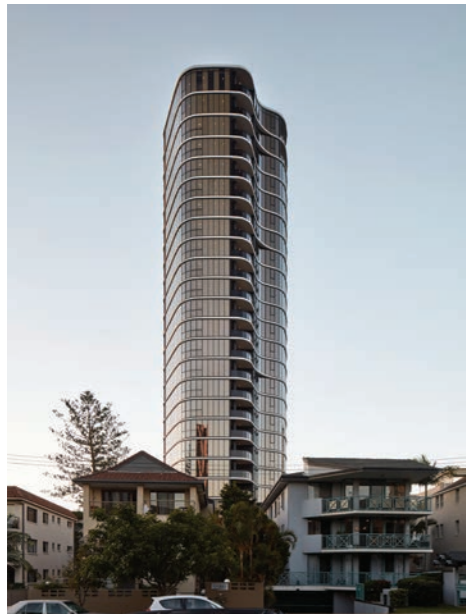
Encore Broadbeach COMPLETE 2021