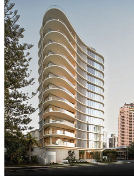
Beach House Broadbeach COMPLETE 2023