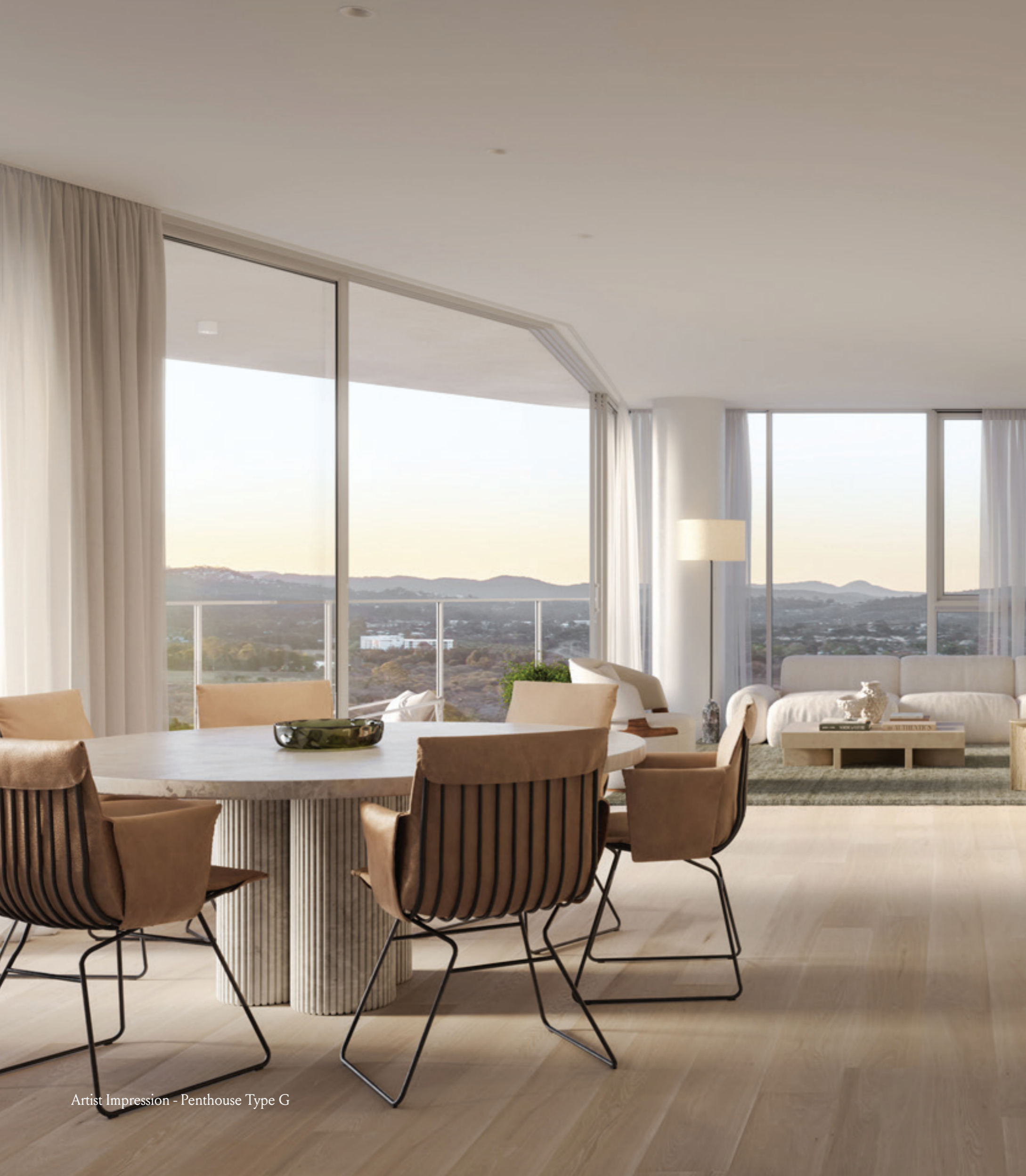
Artist Impression - Penthouse Type G