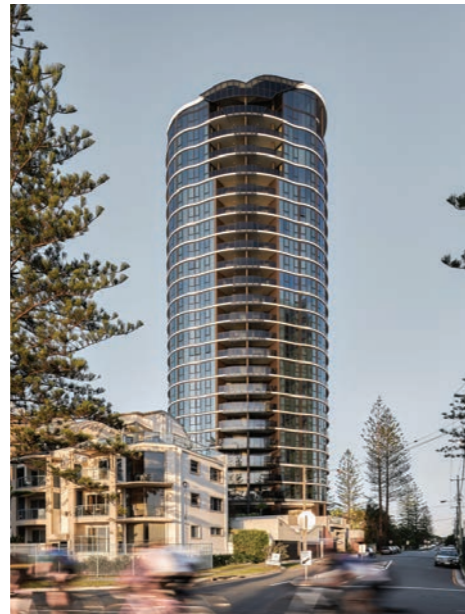
Vue Broadbeach COMPLETE 2020