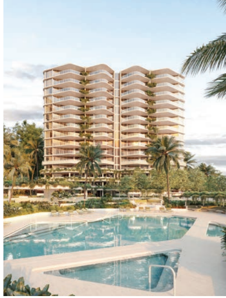
Cascade Robina UNDER CONSTRUCTION