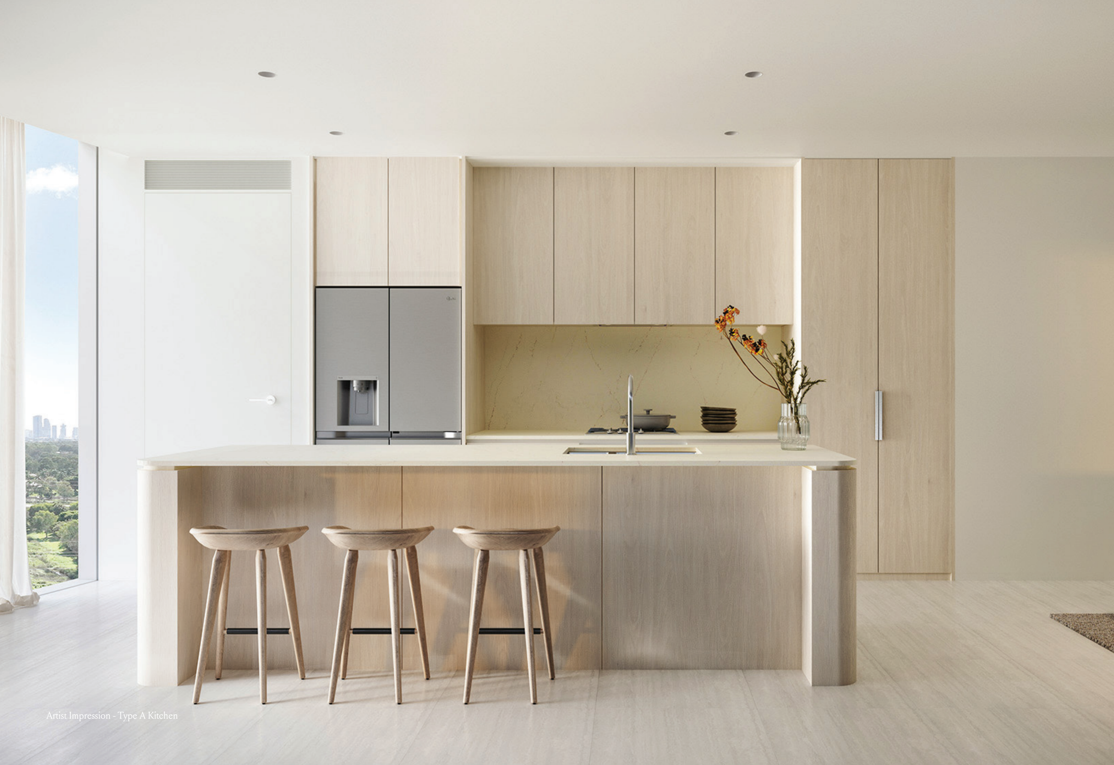
Artist Impression - Type A Kitchen