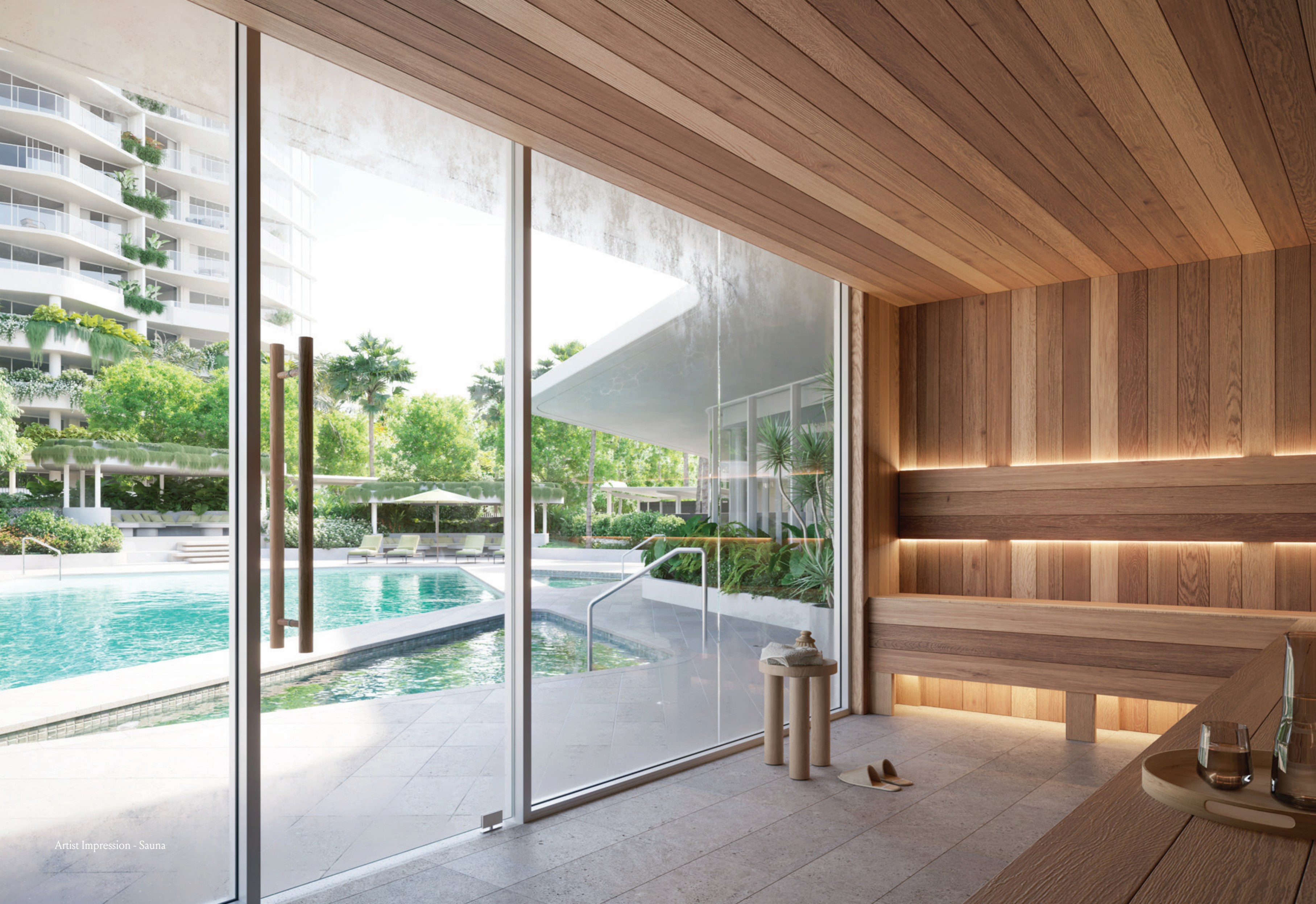
Artist Impression - Sauna