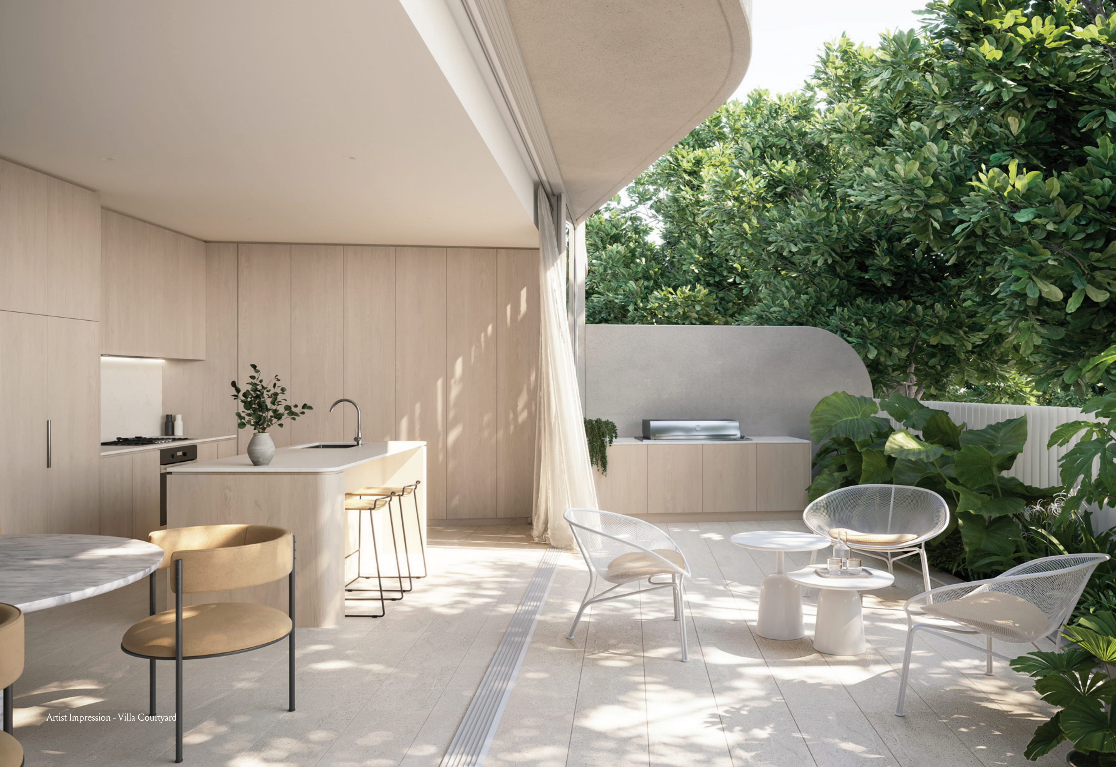
Artist Impression - Villa Courtyard